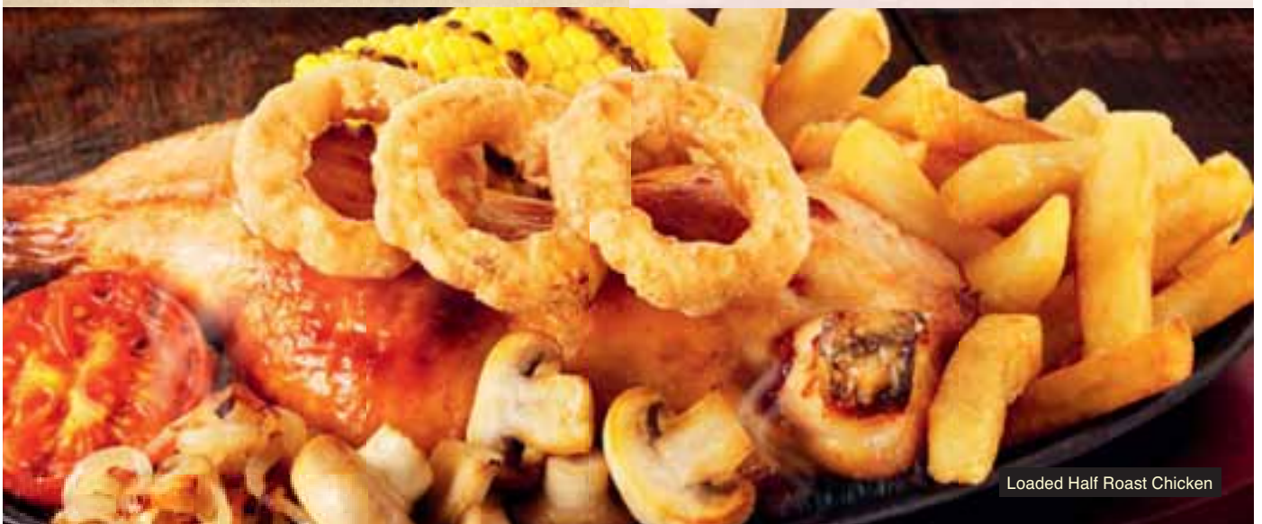
Loaded Half Roast Chicken