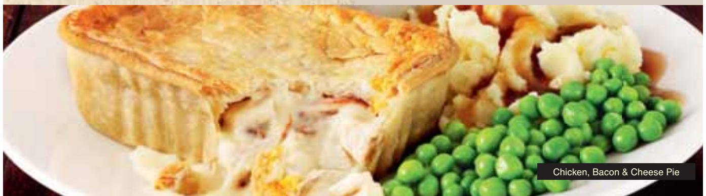
Chicken, Bacon & Cheese Pie