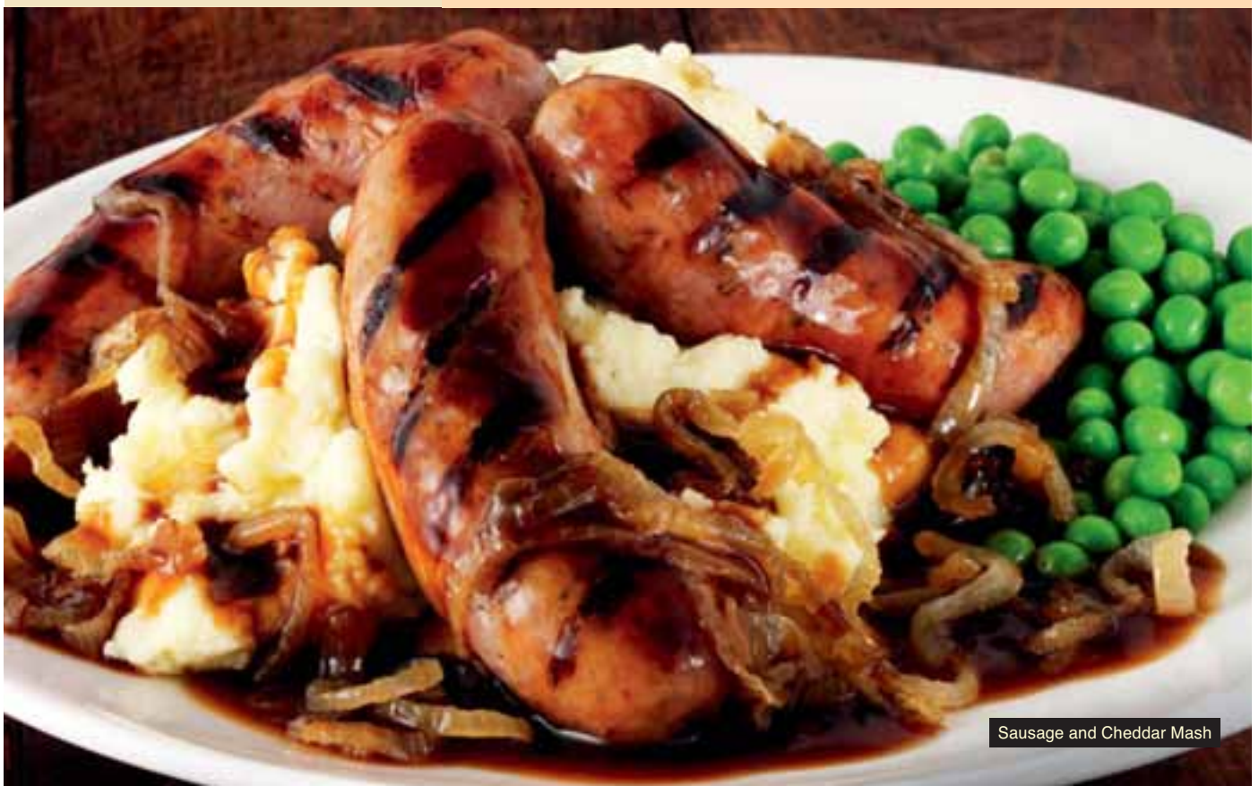
Sausage and Cheddar Mash

Order extra roast potatoes for a £1 and extra Yorkshire pud for 30p